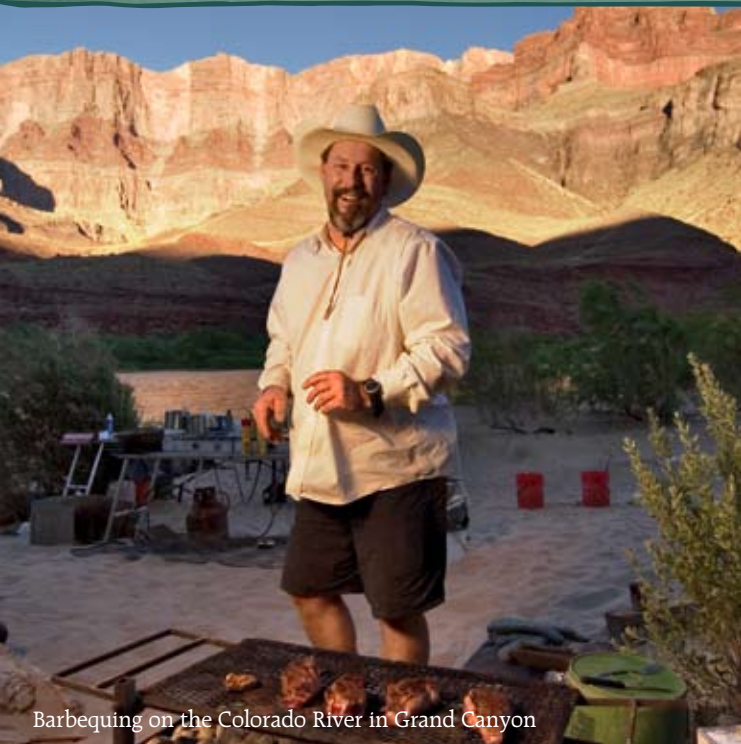
Barbequing on the Colorado River in Grand Canyon