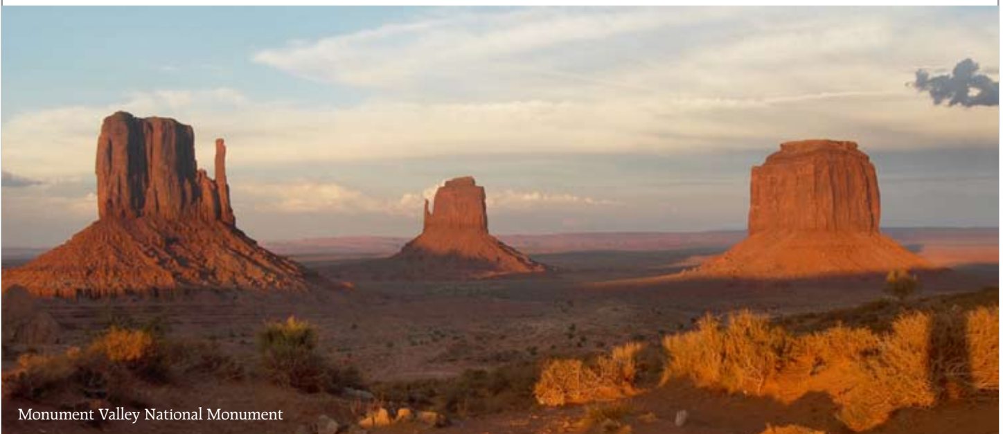
Monument Valley National Monument