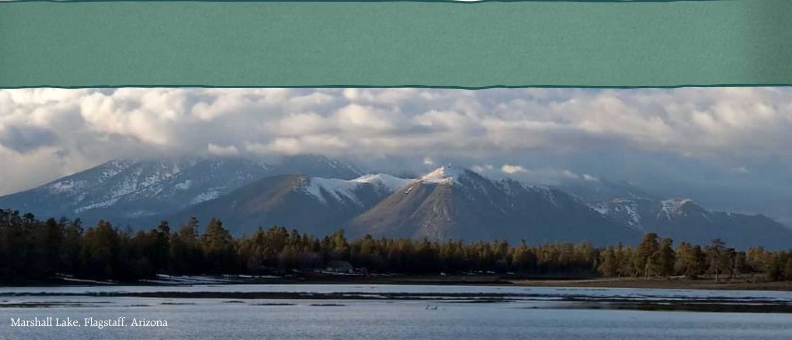
Marshall Lake, Flagstaff, Arizona

for navigating a website, it will also enhance SEO or search engine optimization efforts.