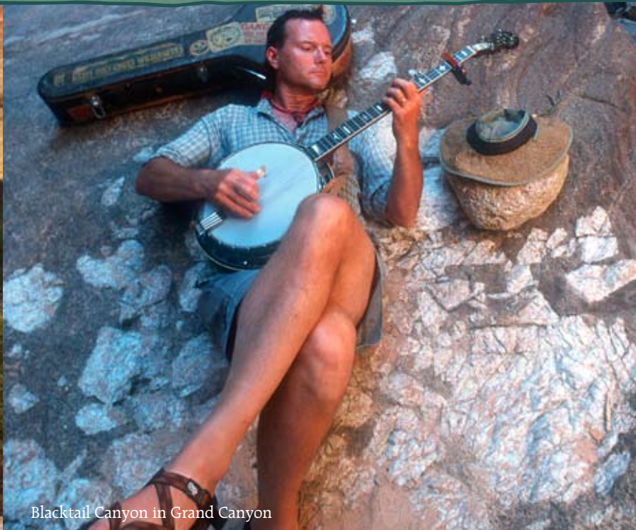
Blacktail Canyon in Grand Canyon

The difference between desktop widgets and web widgets is simply the location where they are being displayed.