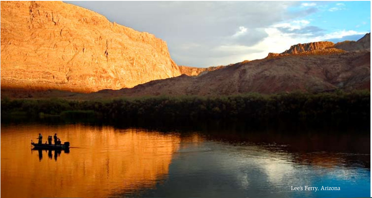
Lee's Ferry, Arizona